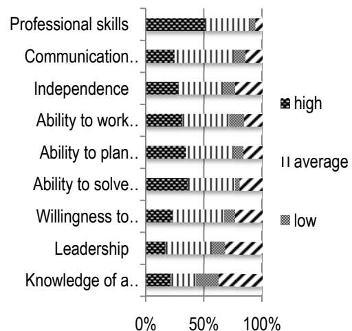
Figure 2 Expert evaluation of the effectiveness of internal training programs (percentage of respondents of Russian and Belarusian experts)

The formation of the majority of the competencies, formed in the result of internal training, experts estimate on average level (Figure 2). The exceptions to this are professional competences with the highest percentage of maximum estimates (38.5%) and knowledge of a foreign language with dominating minimum estimates (37.5%).