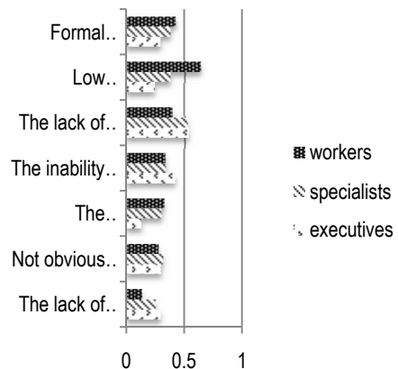
Figure 3 Problems of internal training of personnel (as a proportion of the number of Russian and Belarusian experts)

The experts of the enterprises of both countries were also asked to choose from a proposed list of problems those that can potentially occur during training, as well as the problems that occur in their organization in training workers, specialists and executives (Figure 3).