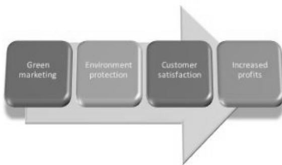
Figure 3 Benefits of going green

Hence, the increasing trend of adopting eco-friendly business, technologies and services has offered new business opportunities for making a profit and led to the emergence of the term green marketing (Fig. 3) (Jain, 2013; Kumar & Ghodeswar, 2015). Green marketing is the part of all the activities designed to generate and facilitate any changes intended to satisfy the requirements of consumers and society without harming the environment (Polonsky, 1994).