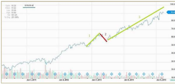
Figure 6 Evaluation of the stock price performance of the Wyndham Worldwide over the period from January 2010 to January 2015.

In January 2015 the company’s stock price enters the 3 rd Elliott wave phase, which is the longest phase of the cycle. Hence, the stock price potentially faces being at the beginning of the corrective 4 th wave, which nevertheless is rather short and will be followed by the 5 th wave which is expected to reach the cycle peak. Hence, we assign the 3/5 rating for Wyndham Worldwide.