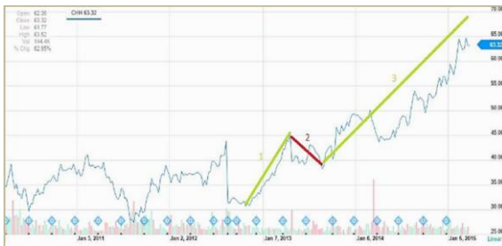
Figure 3 Evaluation of the stock price performance of the Choice Hotels over the period from January 2010 to January 2015.

The stock price dynamics for Choice Hotels, presented in Figure 3 demonstrates presence in the 3 rd Elliott wave phase.