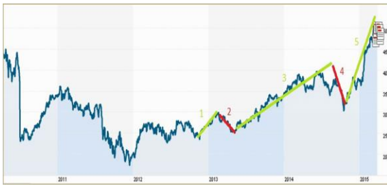
Figure 2 Evaluation of the stock price performance of the Accor Hotels over the period from January 2010 to January 2015.

Based on the analysis of stock price performance for Accor we could conclude that the stock price entered the 5 th impulsive Elliott wave. In the short run the corrective wave A is to follow, hence the stock price will go down. Therefore, we assign the 1/5 rating for Accor in accordance with our assessment model.