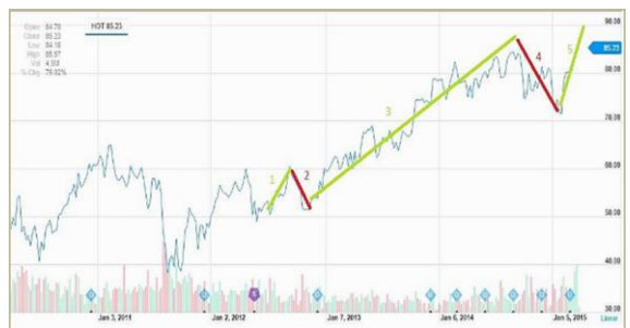
Figure 5 Evaluation of the stock price performance of the Starwood over the period from January 2010 to January 2015.

The cycle for Starwood, as presented in Figure 5 had started in July of 2012.